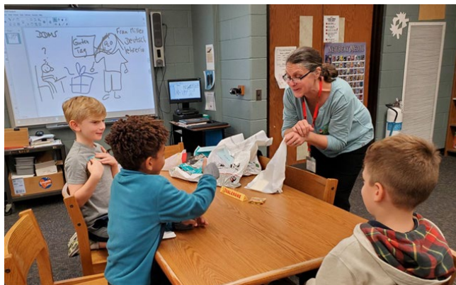
FUTURE GERMAN STUDENTS