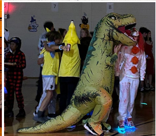
HALLOWEEN SPIRIT AT DVMS