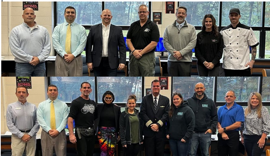
DVMS CAREER DAY SPEAKERS

CAREER DAY AT DVMS: On Wednesday, October 11, 2023, the Delaware Valley Middle School conducted our annual Career Day for 8 th grade students . Multiple presenters from various fields of business and industry spoke to students in grade 8 about their experiences and the requirements necessary to attain jobs in each field of employment. Our guests were treated to a continental breakfast prepared by our Parent Teacher Association in the library before their speaking engagements. After breakfast, speakers were escorted to their specific classroom by their assigned teacher who monitored the students while the speakers lectured.